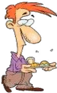
f. Jack / 12:20