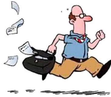
e. Jack / 8:00