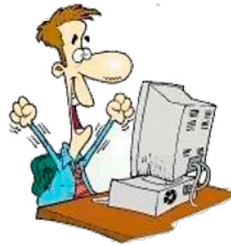
g. Jack / 5:00 p.m.