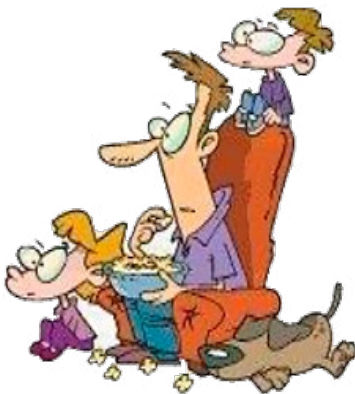
h. Jack / 8:30 - 10:30 p.m.